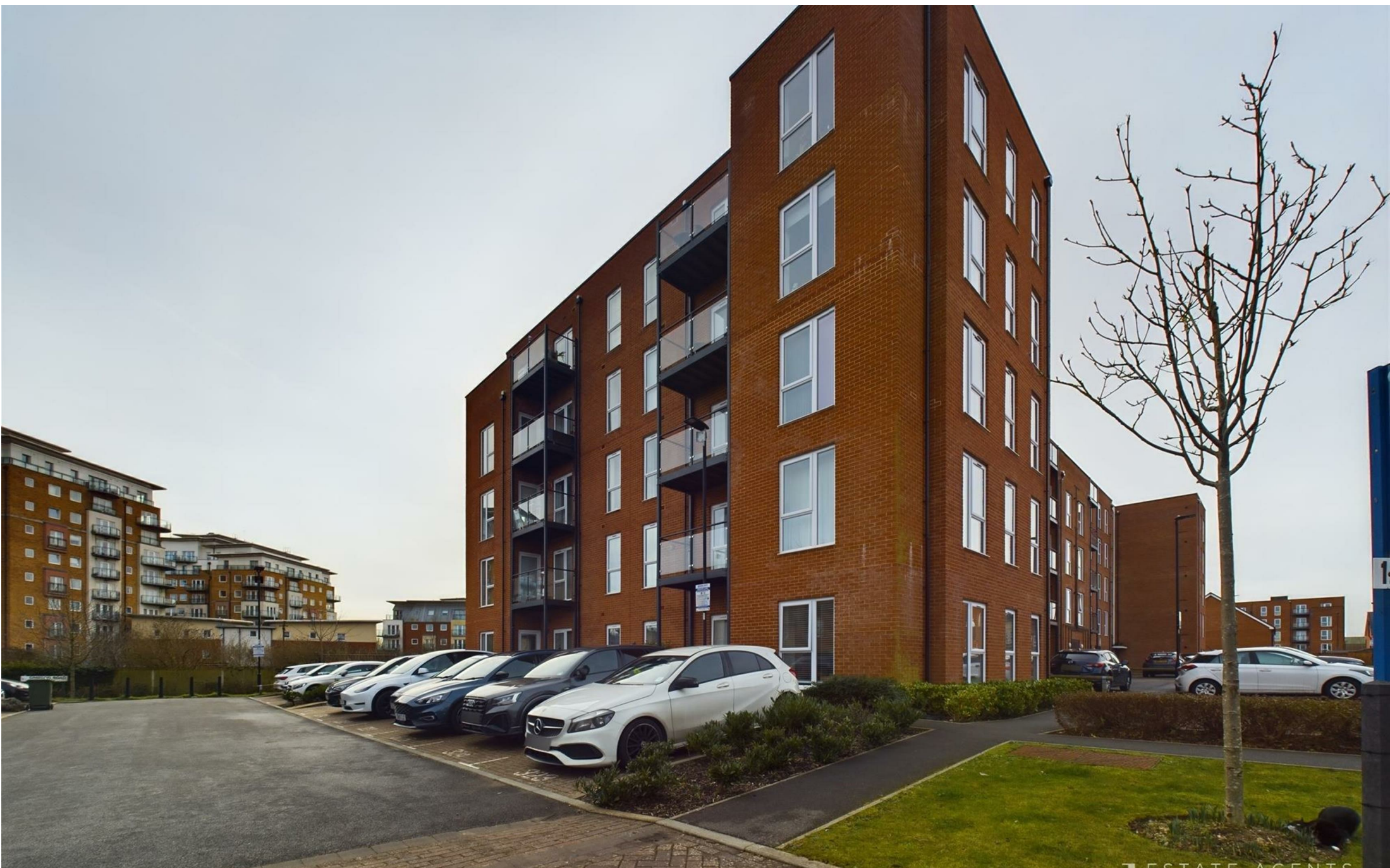
Lambert Court, 1 Strong Drive, Basingstoke, RG21 6AQ